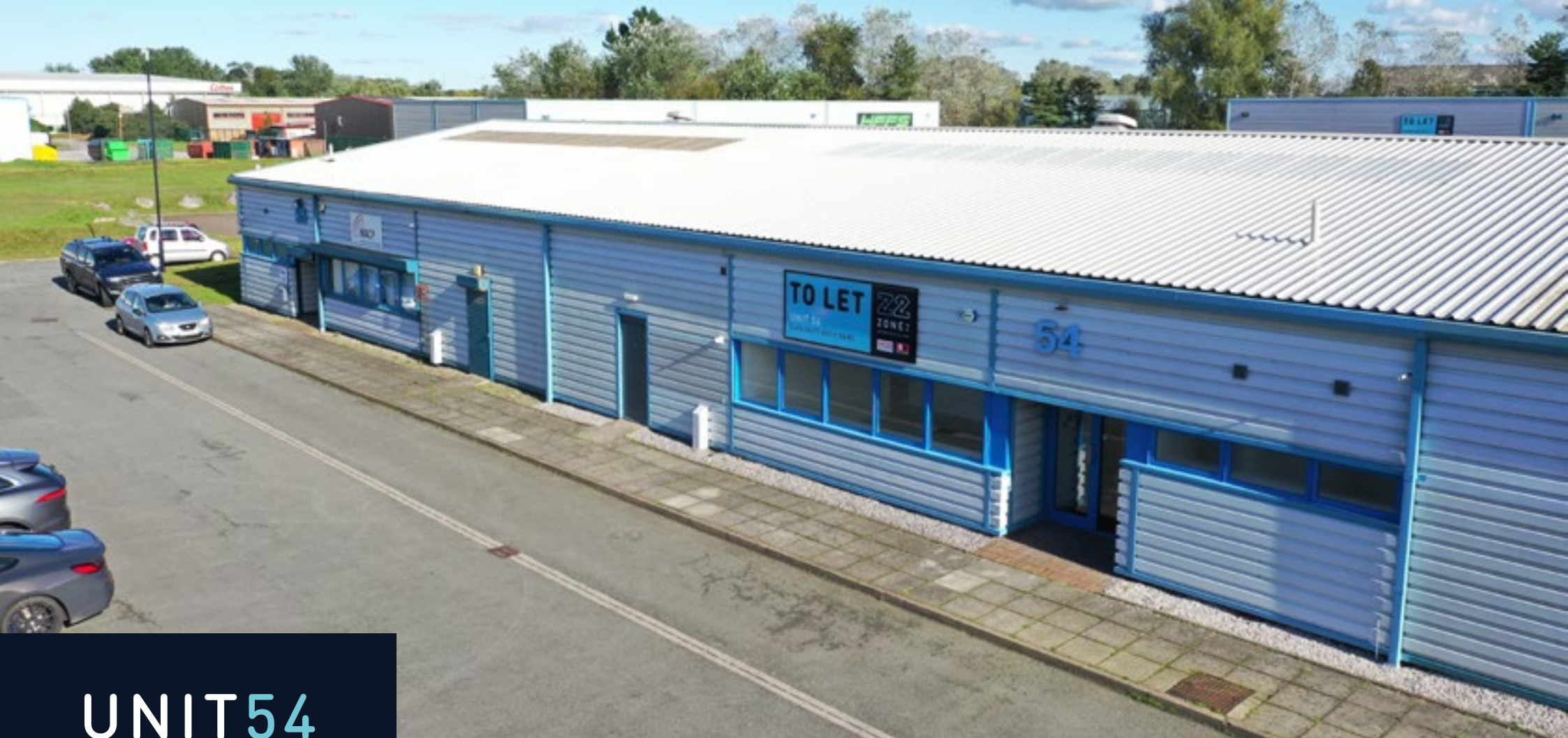
PHOTOS PRIOR TO TENANT OCCUPATION